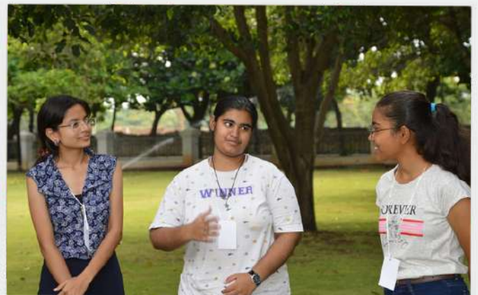
KARM Fellows at Aspen